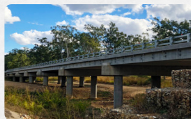
BRIDGES & ROADS