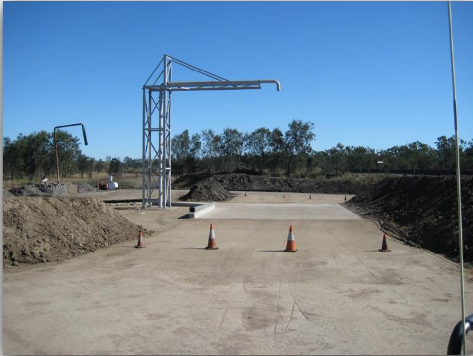
Water Fill Points