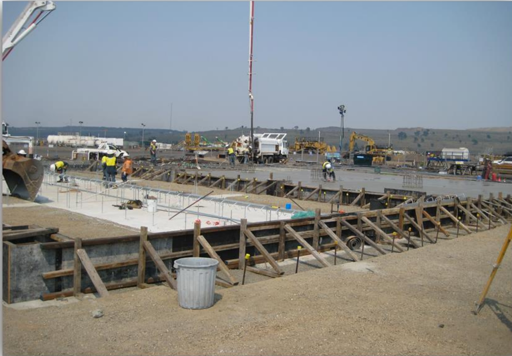
BMC South Walker Creek & Poitrel Mine Workshop Projects – Client BMC