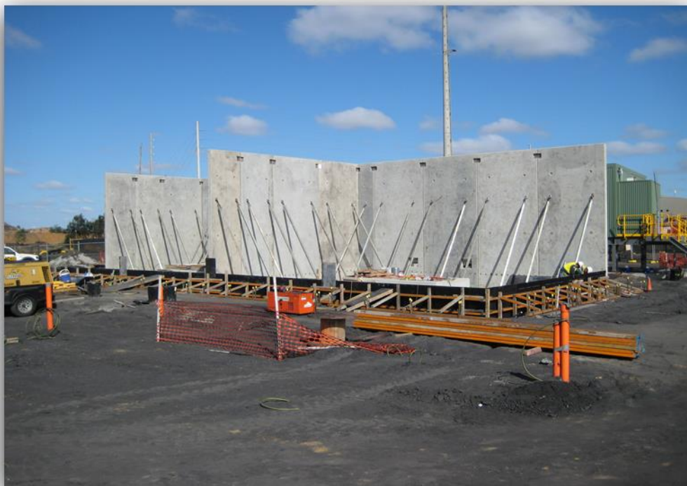
BMA GYR Mine 66-11kV Upgrade Project (Client G&S Engineering)