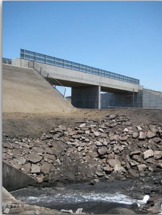
Peak Downs Mine LV-MV Road & Bridge – Client BMA