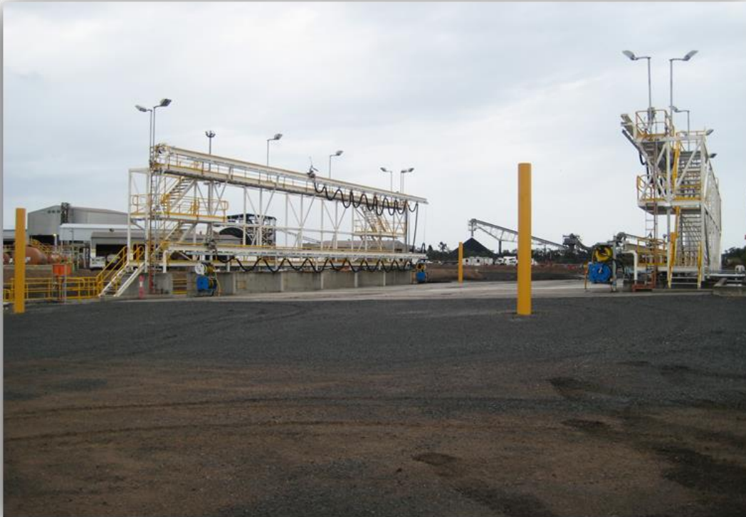
BMA Norwich Park Mine HV-Wash Facility – Client BMA