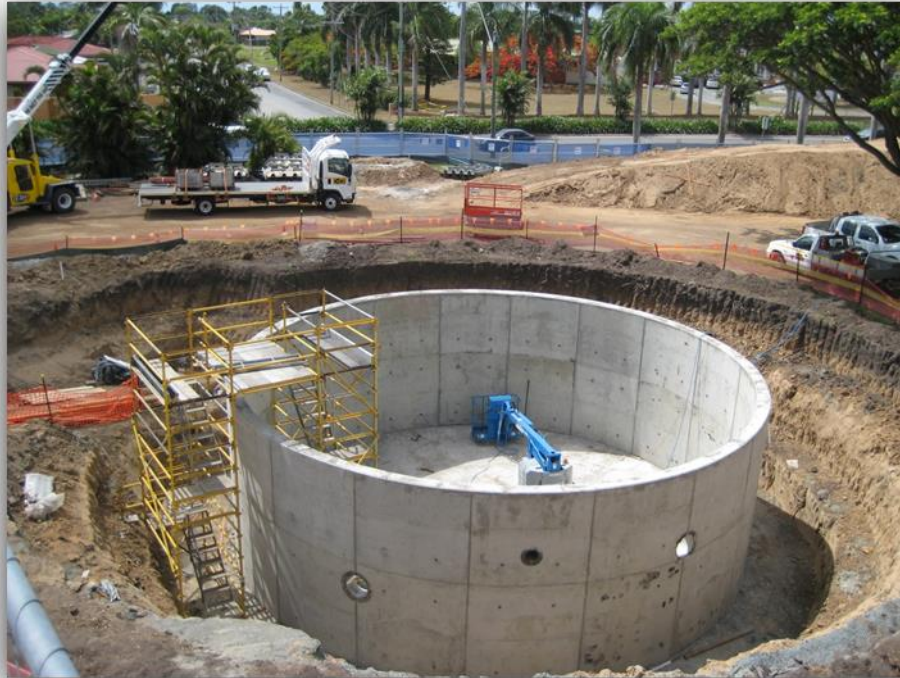
Mackay WTP Upgrade – Washwater & Dewatering Tank Construction (Client – Tenix)