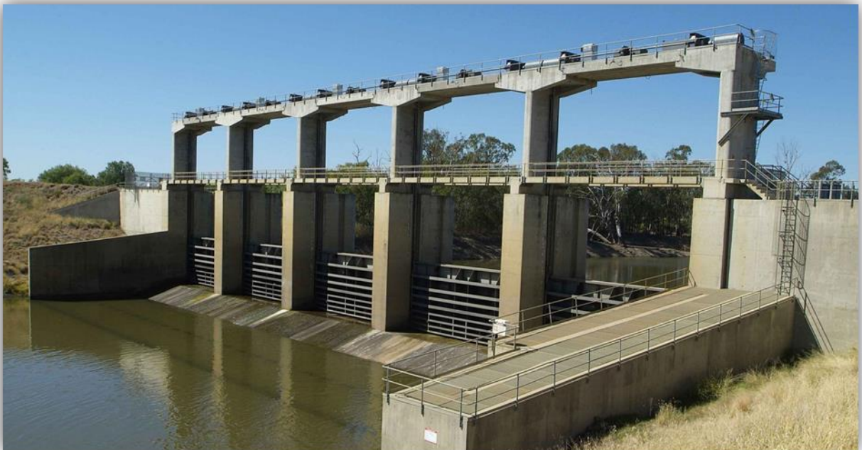
Boggabilla Weir – Client Leighton Contractors