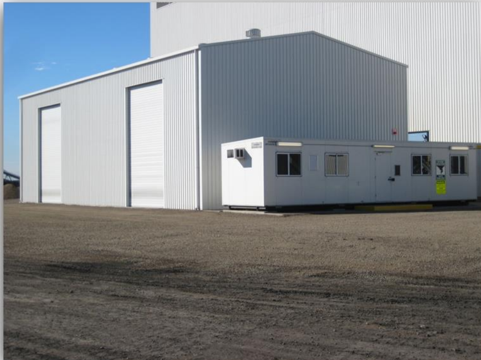
Mine Site Storage Shed and Office Complex