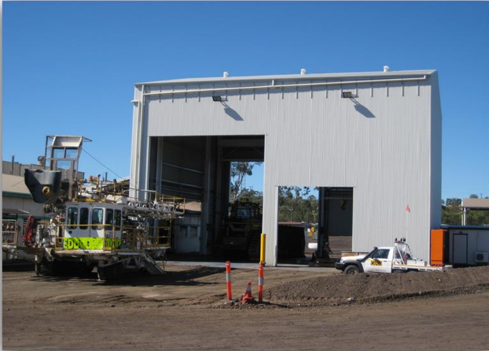
BMA Saraji Bucketshop High Bay Shed 2009 - Construction by C&C, Design by C&C's Principal Design Engineer (Geoff Millar)