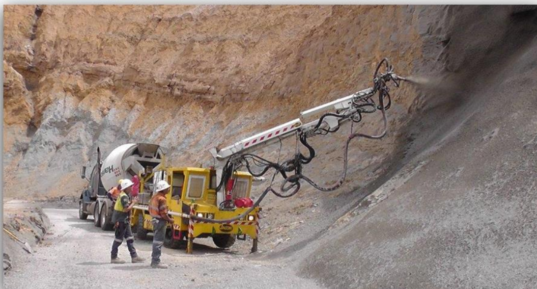
Carborough Downs Mine Box Cut Remediation Project 2011 (30,000m 2 of Shotcrete) – C&C Shotcreting Division – Client Vale