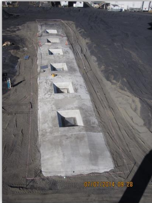
Saraji Mine 3S & Mag Tank Thickener Shutdown Civils – Client BMA