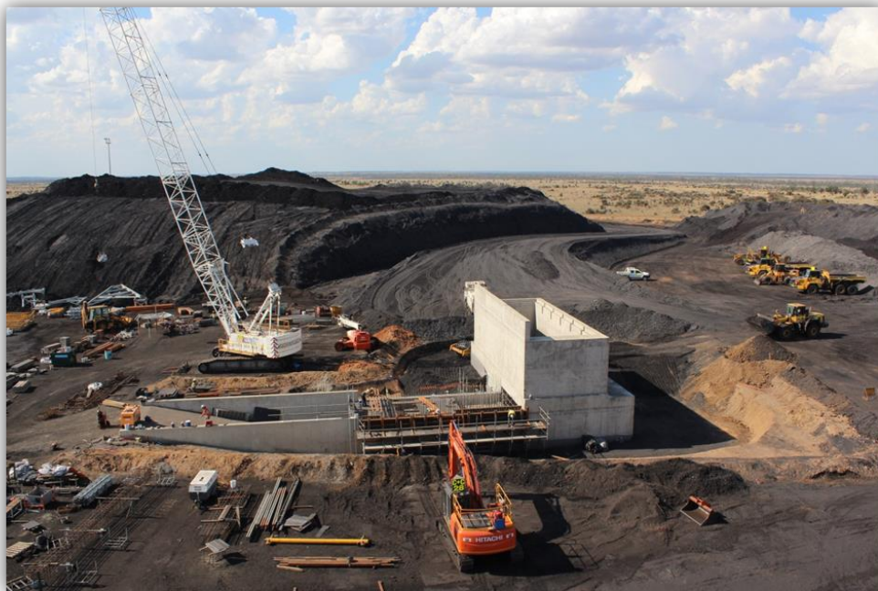
Cook Collery CHPP Expansion (Client – Caledon Resources)