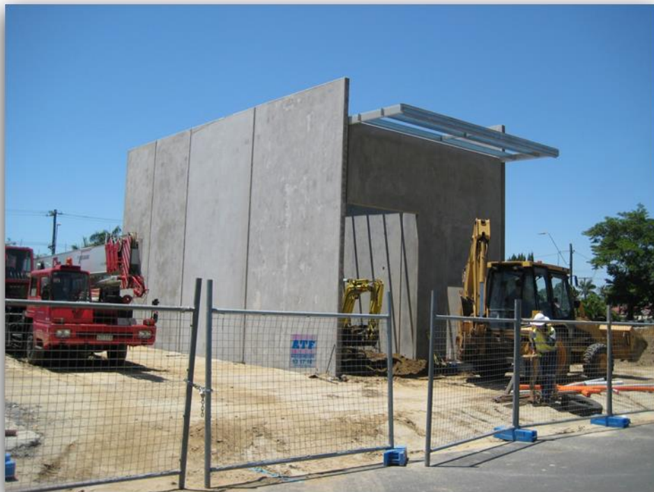
Design & Construction of Tilt Panel Buildings