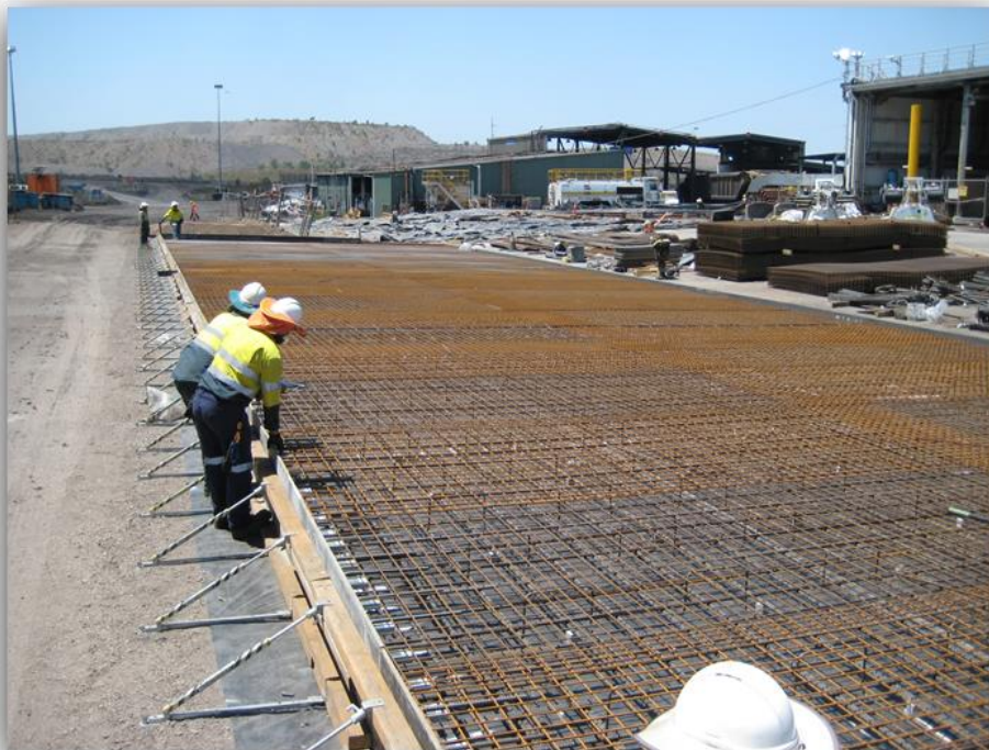
BMA Peak Downs Mine MIA Concrete Aprons – 2,530m 3 – Client BMA