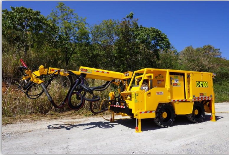
C&C Flameproof Shotcrete Rigs