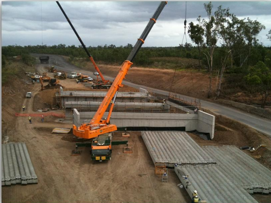
BMC South Walker Creek Mine Bridge Crossing & Haul Road Project (Client BMC)